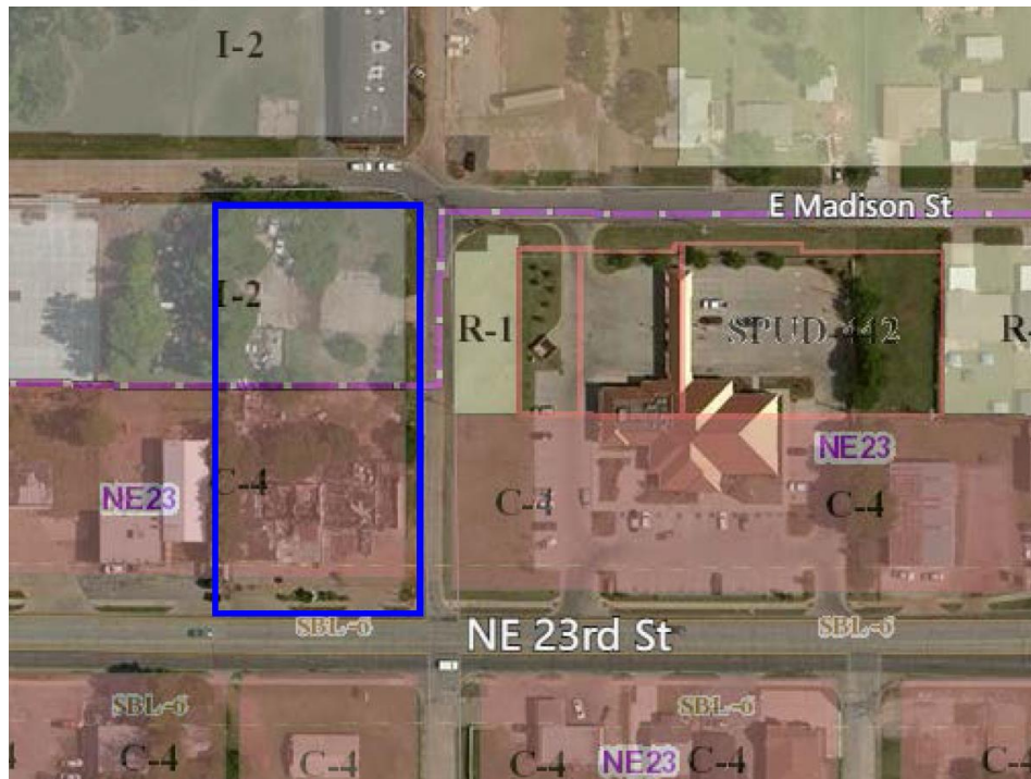
Exhibit 4: The City of Oklahoma City Zoning Requirements

The subject properties are located in a mix of C-4 and I-2 zoning. The City of Oklahoma City's (the City) zoning ordinance defines these defines these zoning types as follows: