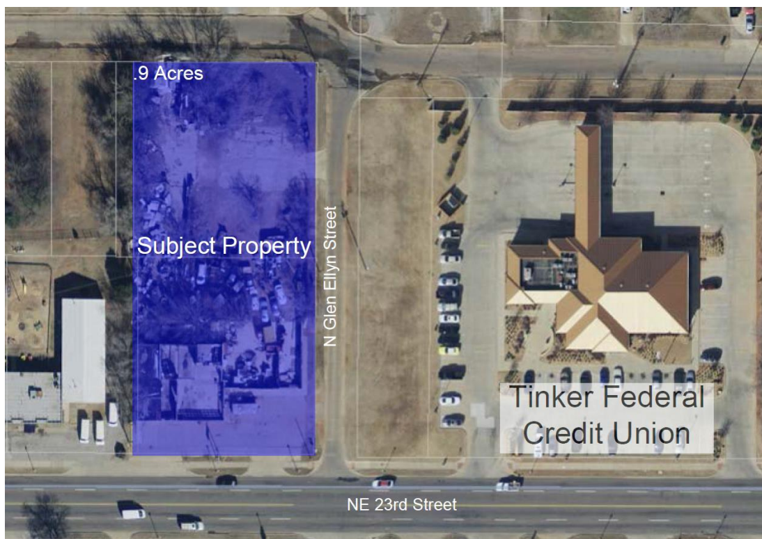
Exhibit 1: Site Location and Context Map

The OKLAHOMA CITY URBAN RENEWAL AUTHORITY (“OCURA”) invites the presentation of written proposals from qualified developers (“Redeveloper”) for the purchase and redevelopment of land owned by OCURA near the intersection of NE 23 rd Street and N Glen Ellyn Street, depicted in Exhibit 1 below. The tract of land is approximately 0.9 acres. The site, located in Northeast Oklahoma City, is part of OCURA’s Northeast Renaissance Urban Renewal Plan. The property is mostly vacant though a concrete foundation and small shed exist on the site.