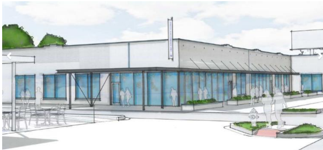
Exhibit 3: Rendering of development at 1700 NE 23 rd Street

Approximately ½ mile from this site, located at NE 23 rd and Rhode Island Avenue, is an exciting new development taking place by local developers, Pivot Project. Pivot Project is rehabilitating a former row of buildings along NE 23 rd Street. The project contains approximately 41,000 square feet of office and retail space. The buildings will be home to Centennial Health Clinic, an eye care clinic, a physical therapy clinic, a barber school several restaurants and more. This is the first major development that has happened in the area in years. The development will be a catalyst to encourage additional commercial development in the years to come.