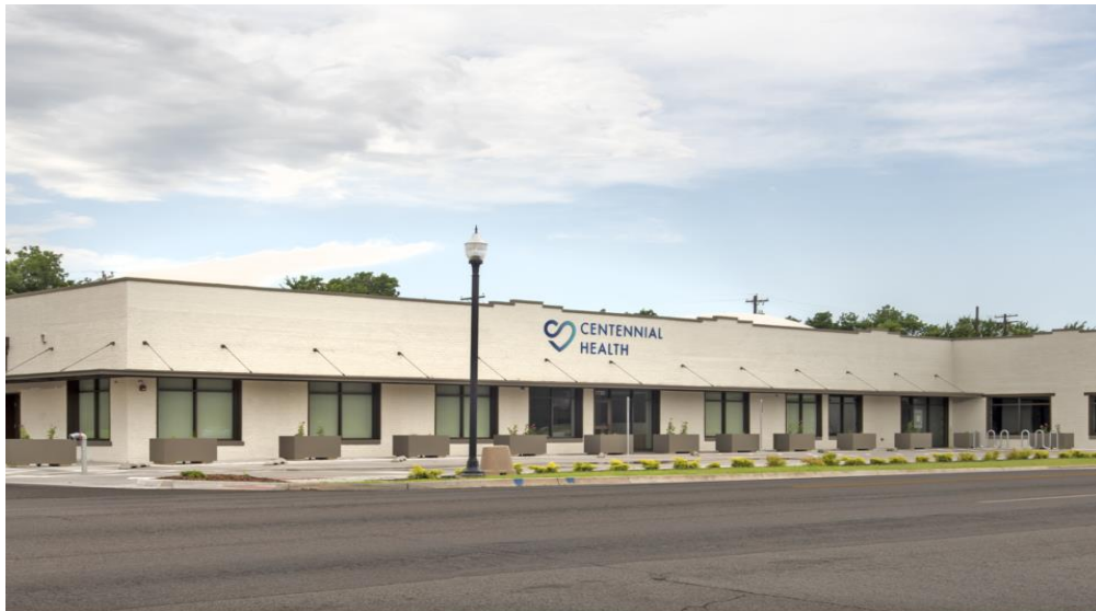
Exhibit 3: Centennial Health at 1720 NE 23 rd Street

Approximately three blocks to the east, located at NE 23 rd and Rhode Island Avenue is an exciting new retail center known as EastPoint by local developers, Pivot Project. Pivot Project has rehabilitated a former row of buildings along NE 23 rd Street. The project contains approximately 41,000 square feet of office and retail space. The buildings are home to Centennial Health , an optometrist, office buildings, restaurants, a coffee shop and more. This is the first major development that has happened in the area in years. The development is a catalyst project.