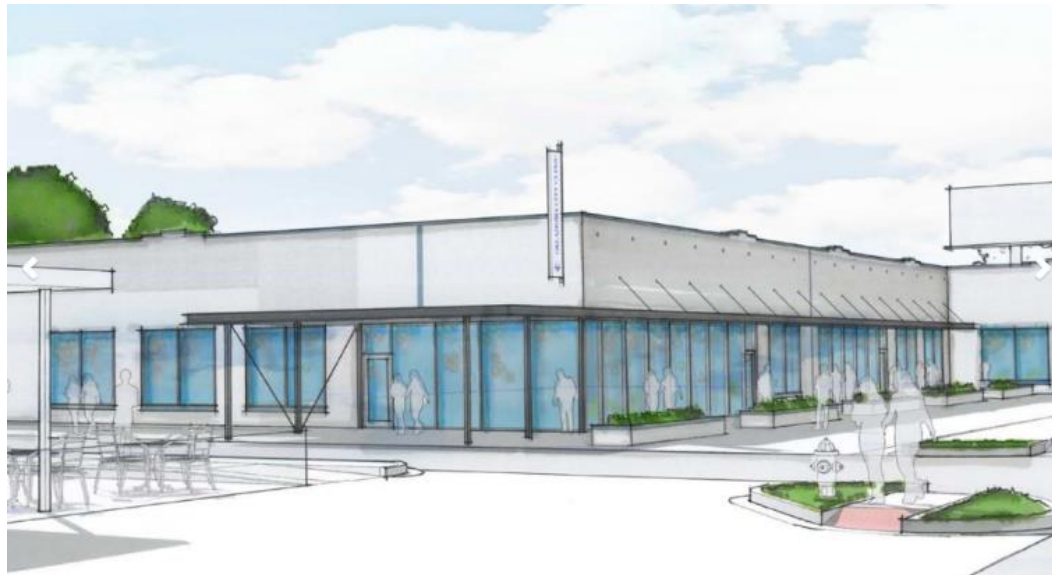
Exhibit 3: Rendering of development at 1700 NE 23 rd Street

Approximately three blocks to the east, located at NE 23 rd and Rhode Island Avenue is an exciting new development taking place by local developers, Pivot Project. Pivot Project is rehabilitating a former row of buildings along NE 23 rd Street. The project contains approximately 41,000 square feet of office and retail space. The buildings will be home to Centennial Health Clinic, an eye care clinic, a physical therapy clinic, a barber school, several restaurants and more. This is the first major development that has happened in the area in years. The development will be a catalyst to encourage additional commercial development in the years to come.