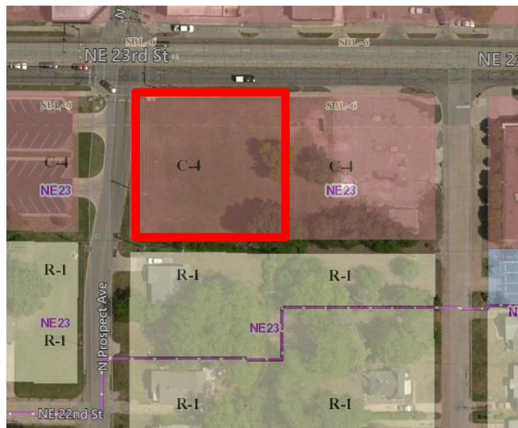
Exhibit 4: The City of Oklahoma City Zoning Requirements

C-4 – General Commercial District. The C-4 District is intended for the conduct of wholesale, retail and office business activities that serve the needs of citizens from anywhere in the metropolitan area, rather than being oriented only to surrounding residential areas. Because the permitted uses may serve and employ a large number of people from a large part of the metropolitan area, the activities conducted, and the traffic generated make this district very much incompatible with residential development. The Comprehensive Plan policy does not support further expansion of the C-4 District.