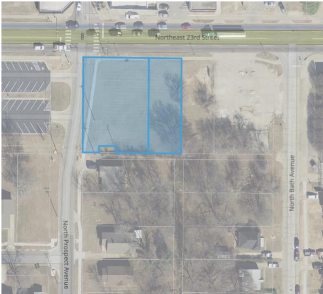
Exhibit 1: Site Location and Context Map (OCURA property depicted in blue)

The OKLAHOMA CITY URBAN RENEWAL AUTHORITY (“OCURA”) invites the presentation of written proposals from qualified developers (“Redeveloper”) for the purchase and redevelopment of approximately half of an acre tract of land, depicted on Exhibit 1 below: